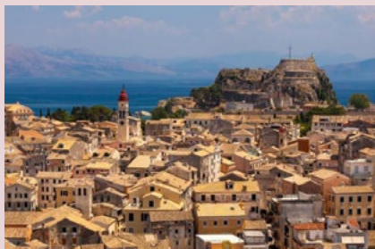
Corfu - Historical Centre

The conference activities will take place at Department of History, Ionian University, Corfu Island, Greece. The Conference will organize for all participants a guided one-hour "Walking Mobile Workshop" in the historical centre of Corfu city, passing by all important monumental buildings and squares. The historical centre of Corfu city has been classified and is protected as World Heritage by UNESCO. The conference will organize for all participants one-day-cruise to Paxos Islands by chartered boat on Wednesday 22 June 2022.